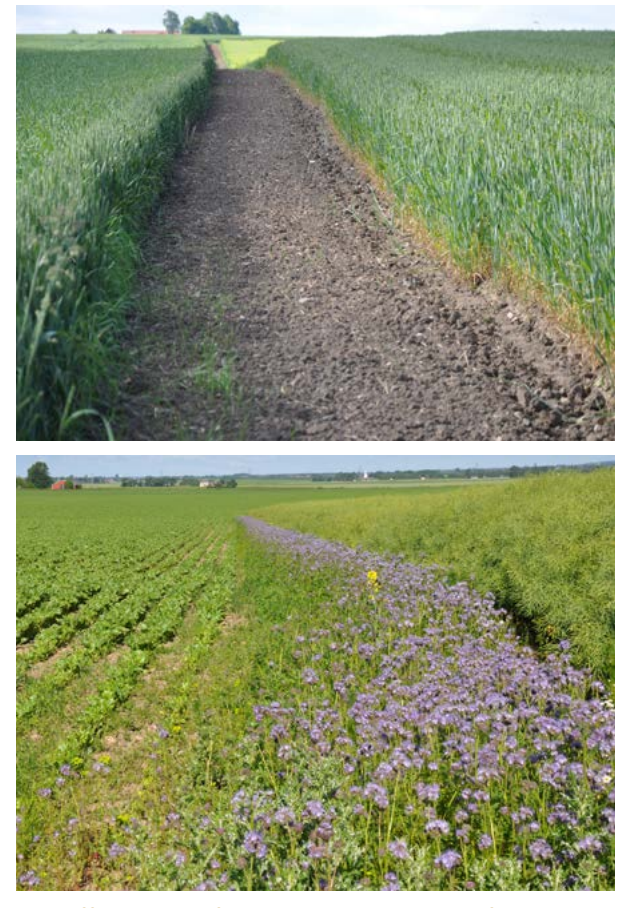
Two different ways of implementing uncultivated field margins, the EFA with the most generous scaling factor in Sweden: regularly tilled bare soil with doubtful environmental effect (top), or sown with flower seeds (here phacelia) to benefit pollinators.

Consequently, and in consensus with our local stakeholders, it is unlikely that current EFA obligations will generate environmental benefits commensurate with greening payments. Further, since the EFA obligation targets individual farms, it is not likely to promote efficient management of biodiversity and intermediate ecosystem services (pollination and biocontrol), because these depend on landscape-scale processes. Rather efficient landscape management requires incentives that encourage collaboration among farmers to optimize the placement of ecological interventions in the landscape.