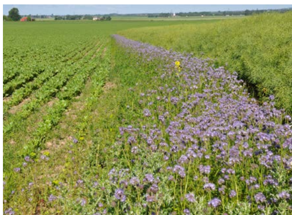
Two different ways of implementing uncultivated field margins, the EFA with the most generous scaling factor in Sweden: regularly tilled bare soil with doubtful environmental effect (top), or sown with flower seeds (here phacelia) to benefit pollinators.